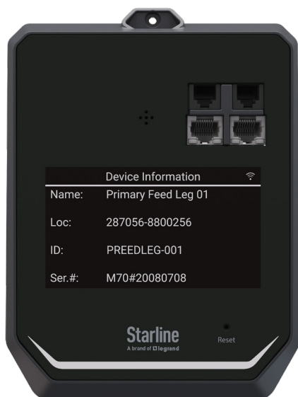
M73 (2) RJ11, (2) RJ54, Lg. Display