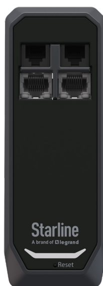
V74 Wi-Fi + (2) RJ11, (2) RJ54, No Display