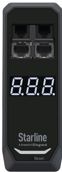
V72 (2) RJ11, (2) RJ54, Display