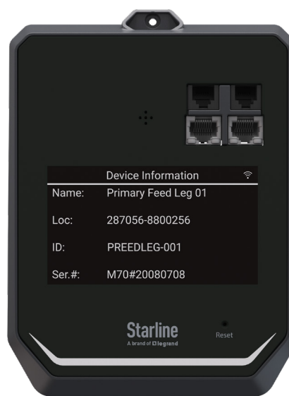
M76 Wi-Fi + (2) RJ11, (2)RJ54, Lg. Display