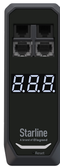
V75 Wi-Fi + (2) RJ11, (2) RJ54, Display