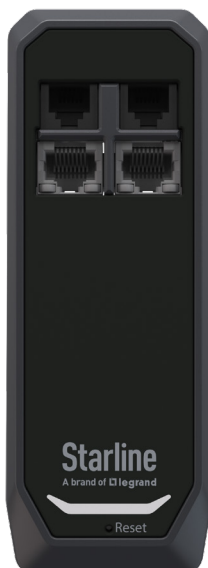
V71 (2) RJ11, (2) RJ54, No Display